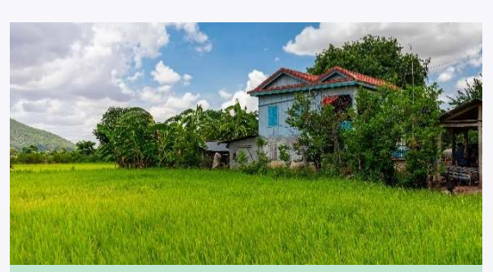
Agriculture is vital for Cambodia's social and economic resilience during and after COVID-19. This rural area was cleared of landmines with Australian support

Economic stimulus and social protection: The IDPoor national poverty database is the backbone of the Cambodian Government's COVID-19 cash transfers to poor and vulnerable households, reaching at least 560,000 households with a total of US$25 million per month. Australia has provided more than A$14 million over ten years to build and maintain Cambodia's